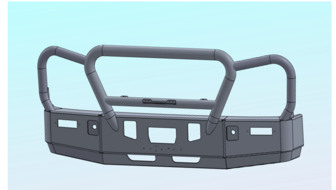
Figure 1 - Bullbar assembly