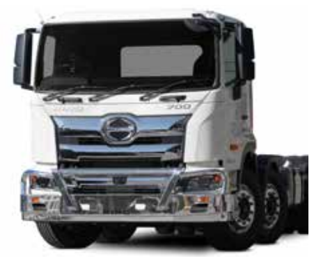
A09 Engined vehicle