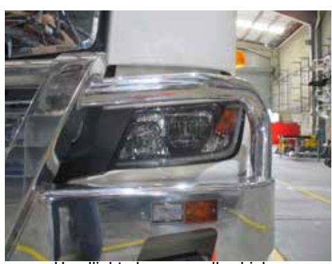
Headlight clearance all vehicles