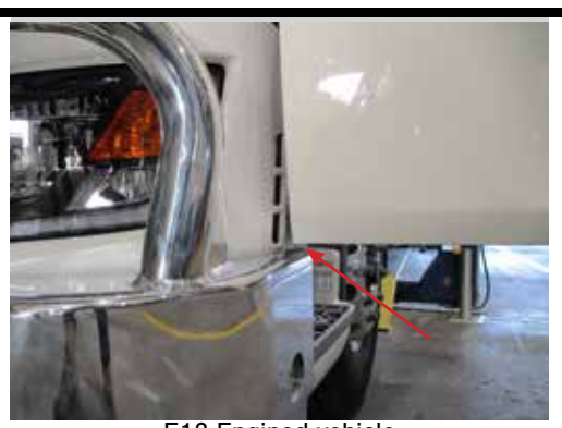
E13 Engined vehicle Ensure distance between door and bullbar is minimum 15mm