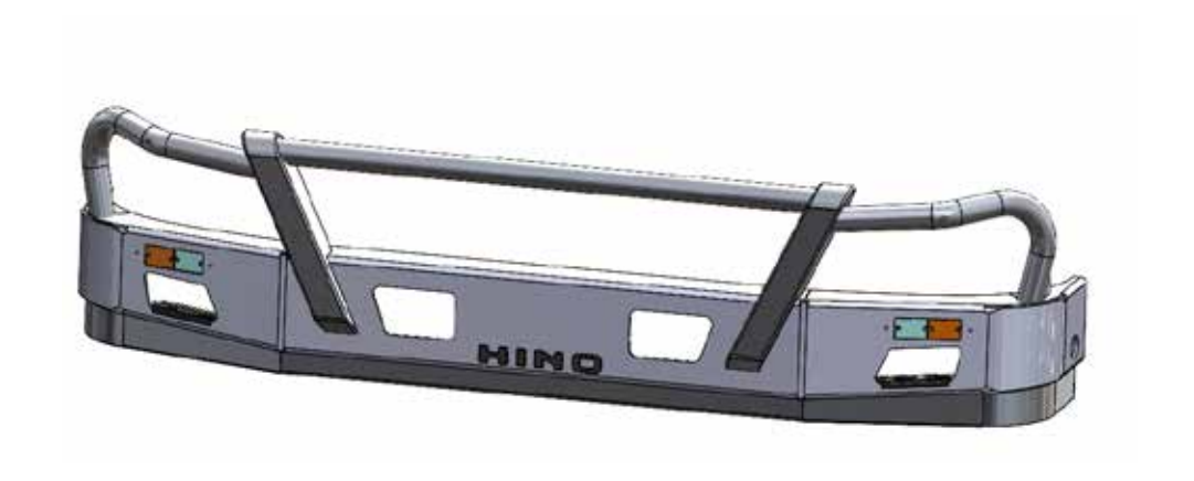
Figure 1 - Bullbar assembly

Fig.2 - 1x Pair steel mounting brackets (Fitted to Bar)