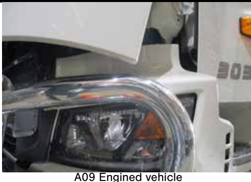
Check distance to corner of bonnet from headlight loop of Protection Bar