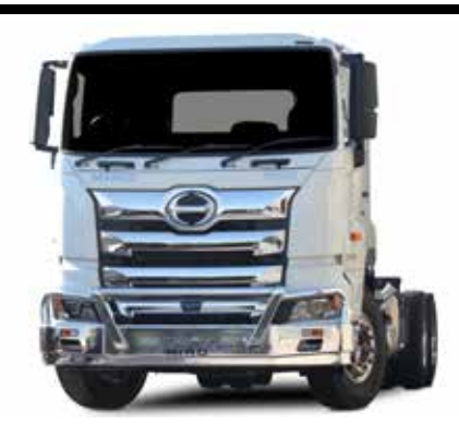
E13 Engined vehicle