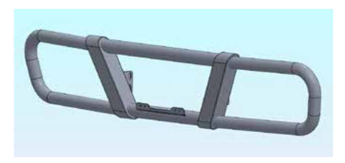
Figure 1 - Bullbar assembly

Fig.2 - 1x Pair steel mounting brackets (Fitted to Bar)