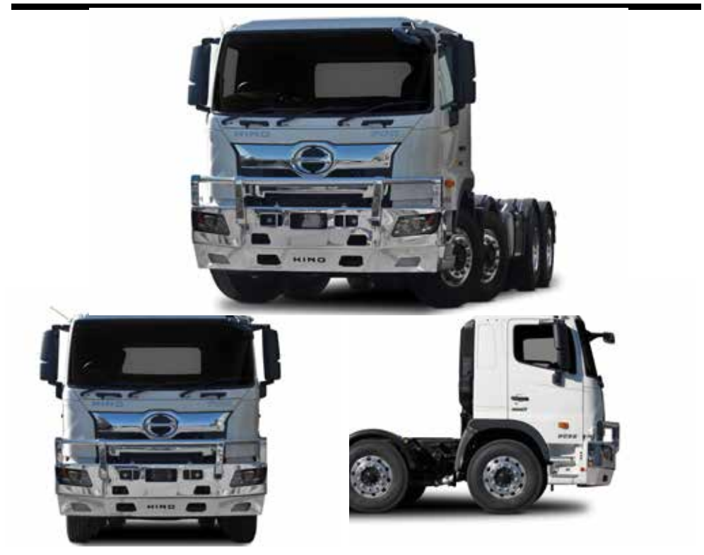
A09 Mid Profile Bar