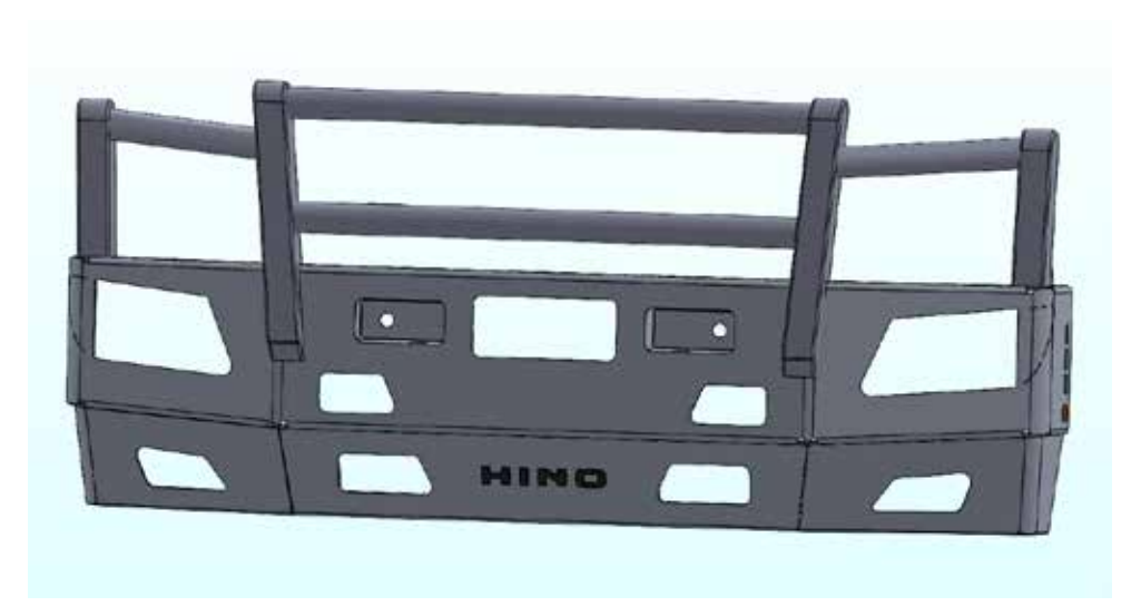
Figure 1 - Bullbar assembly

Fig.2 - 1x Pair steel mounting brackets (Fitted to Bar)