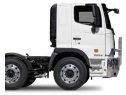
A09 Full Protection Bar