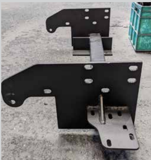
Steel Chassis support Mounts - In bolt kit

_____/_____ Wrapper's initials / Checker initials