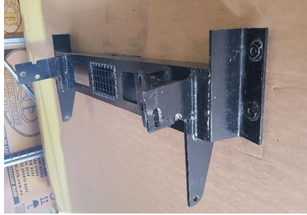
STEEL MOUNT – SIDE VIEW