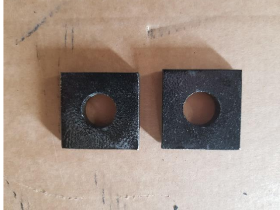
50mm x 50mm x 10mm PLATES

_____ Wrapper's Initials _____ Checker's Initials