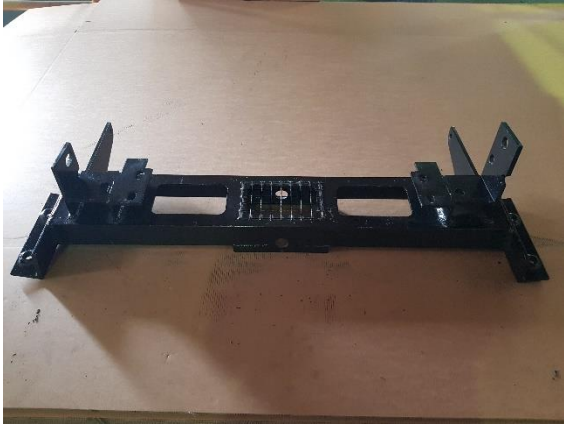
STEEL MOUNT – FRONT VIEW