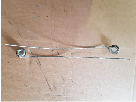
NUT AND WASHER ON WIRE