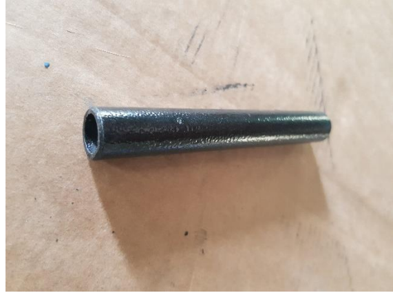
125mm HEADLIGHT TUBE