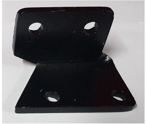
PASSENGER SIDE STEEL MOUNT